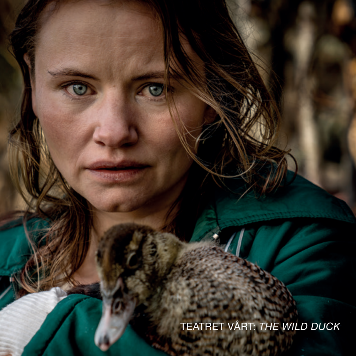
TEATRET VÅRT: THE WILD DUCK