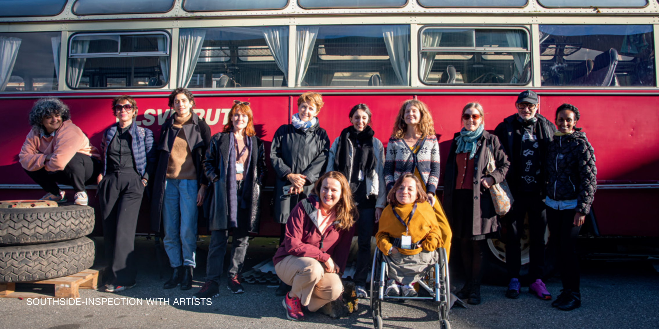
SOUTHSIDE-INSPECTION WITH ARTISTS