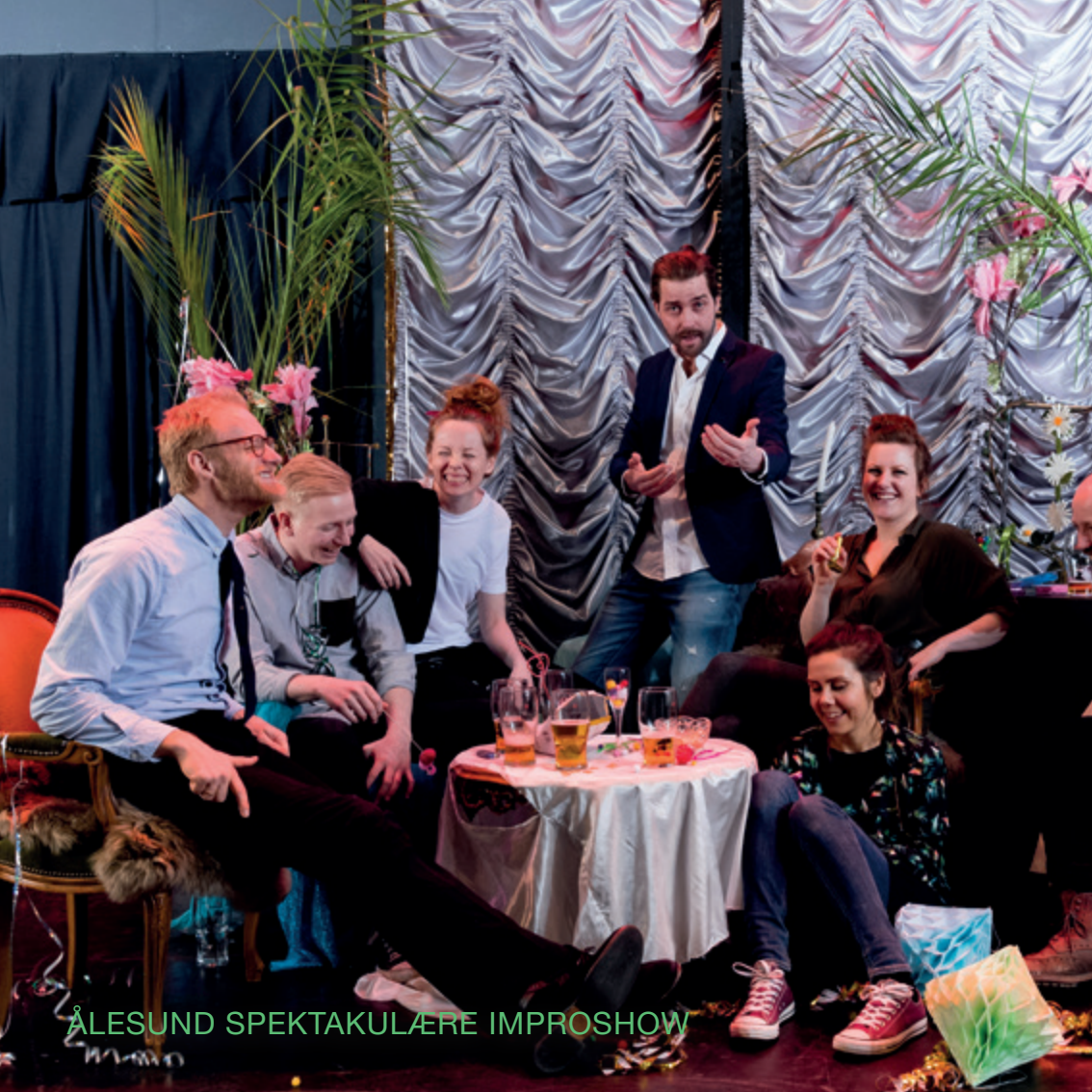
ÅLESUND SPEKTAKULÆRE IMPROSHOW