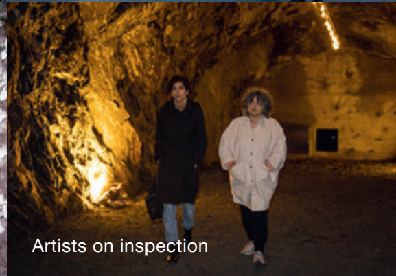
Artists on inspection